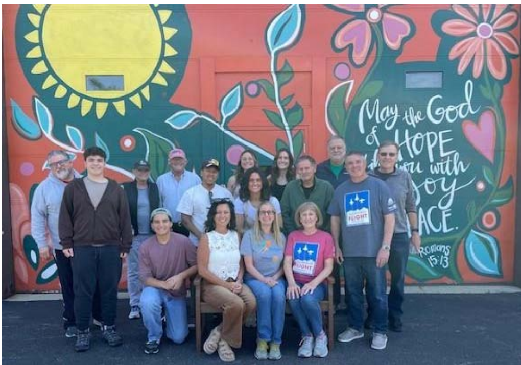
Rotary volunteers strengthen our community in many ways. One Saturday

per quarter we sort and box food at the WARM warehouse at 150 Heatherdown Drive from 10 am to noon. Our remaining date for 2025 is: